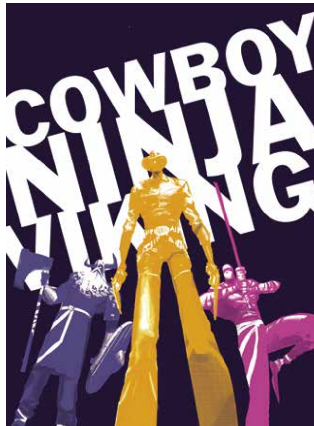
Title: Cowboy Ninja Viking Deluxe, Image Comics

AUArts Alumni 2004, BDes, Visual Communication Design