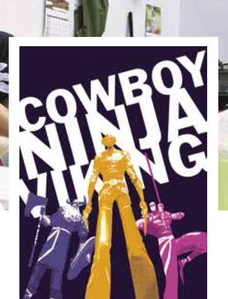
Title: Cowboy Ninja Viking Deluxe, Image Comics

AUArts Alumni 2004, BDes, Visual Communication Design